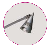
halogen design spot