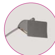
halogen wide-beam light