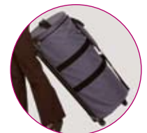
standard carrier case on wheels