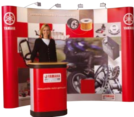
full-colour printed panels

attractive counter using a special full colour panel and a luxurious wooden top (optional)!