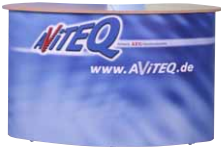
2x2 c (curved)