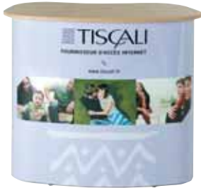
2x1 c (curved)