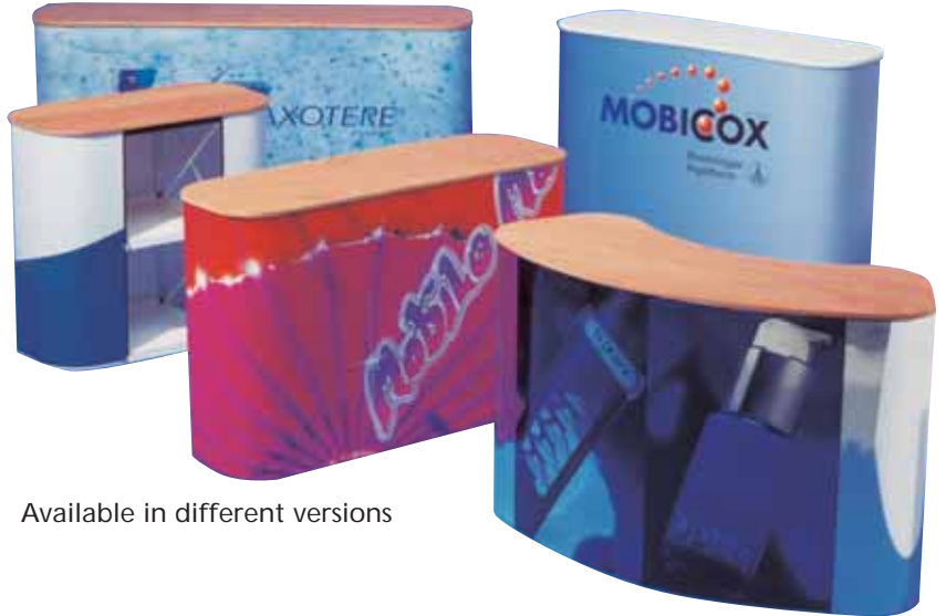
Available in different versions